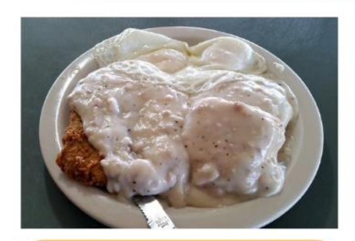
Chicken fried steak served with two eggs and one biscuit and gravy

Prices valid Monday through Friday, 6:30 AM - 10:30 AM Not valid on holidays, or with large groups. No substitutions.