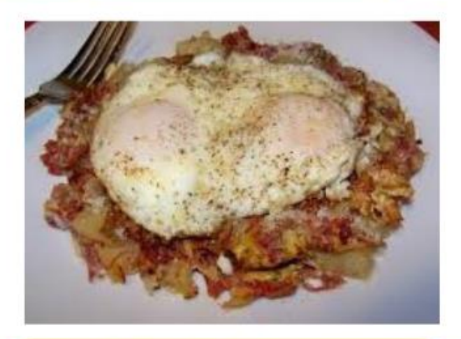
Corned beef fried up with onions & potatoes, served with two eggs and toast or biscuit