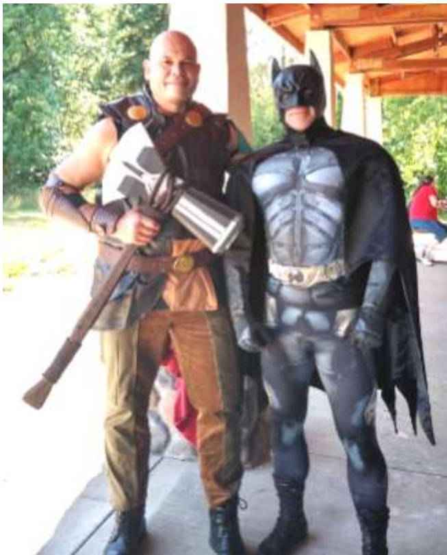
Thanks Batman and Thor for hanging out at Super Hero Carnival!