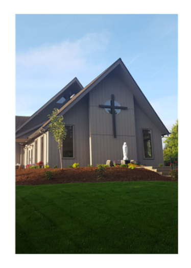
ST. MARY CHURCH—SHAW