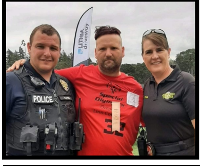
Special Olympics Regional Track and Field Competition