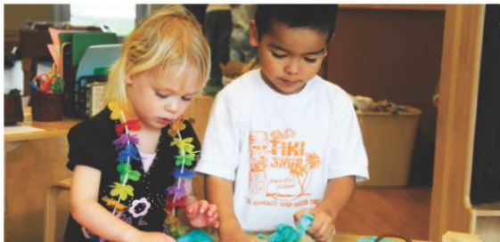
For families with children 0-5 years of age